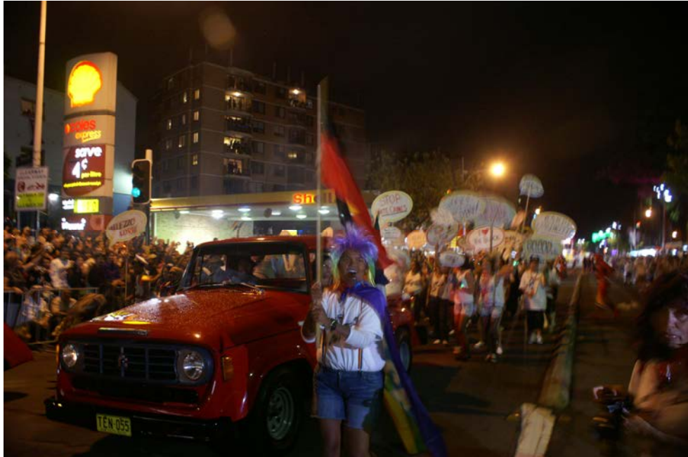
The First Australian's parade entry 'Survivors'

Recommendation 18: Have a meeting with New Mardi Gras prior to the 2012 First Australians community parade entry to talk about the media strategy for 2012.