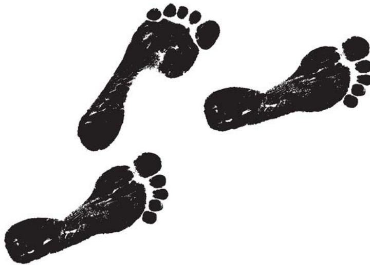
Front design of the t-shirts

It was decided in the first community meeting the theme of the parade entry would be 'Survivors'. At this meeting the image for the t-shirts was workshopped and participants decided on having footsteps on the front to symbolise moving ahead, walking ahead and the survival of our people.