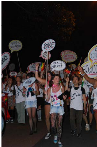
Participants in the 'Survivors' parade entry

Members of the community were encouraged to register for the parade entry via the Aboriginal and Torres Strait Islander project website, or by contacting ACON on our Freecall telephone number. They could also register for the parade at the Yabun Festival and Fair Day. Participants in the parade entry were from all over Australia and the world. There were groups of parents and their children, Aunties supporting their nephews and nieces, groups of friends, families and single people.