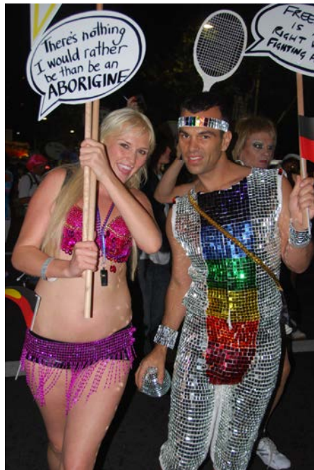
Participants in the First Australians float 'Survivors'