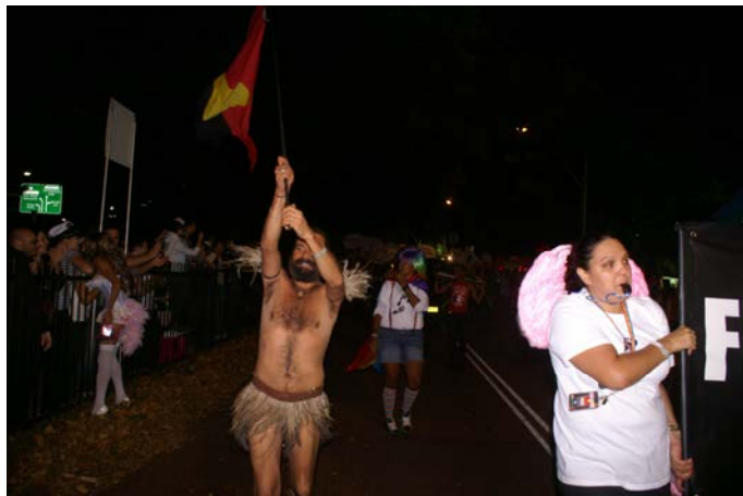
Participants in the first Australians parade entry

Recommendation 7: Continue to have online Parade registrations and poster promoting the parade and call out for participants to display in venues.