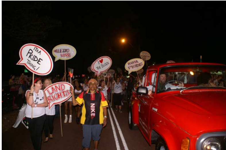
Participants around the big red truck

Recommendation 5: Continue to have the big red truck and music for the 2012 community parade entry.