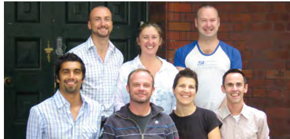
The PLC Team

There are art and craft activities, guest speakers and free morning tea and lunch are provided. It's a great opportunity to meet other women who are affected by HIV in a relaxed and friendly environment and children are most welcome to come along.