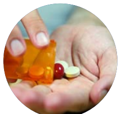
Treatments: The basics