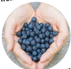
Looking after yourself